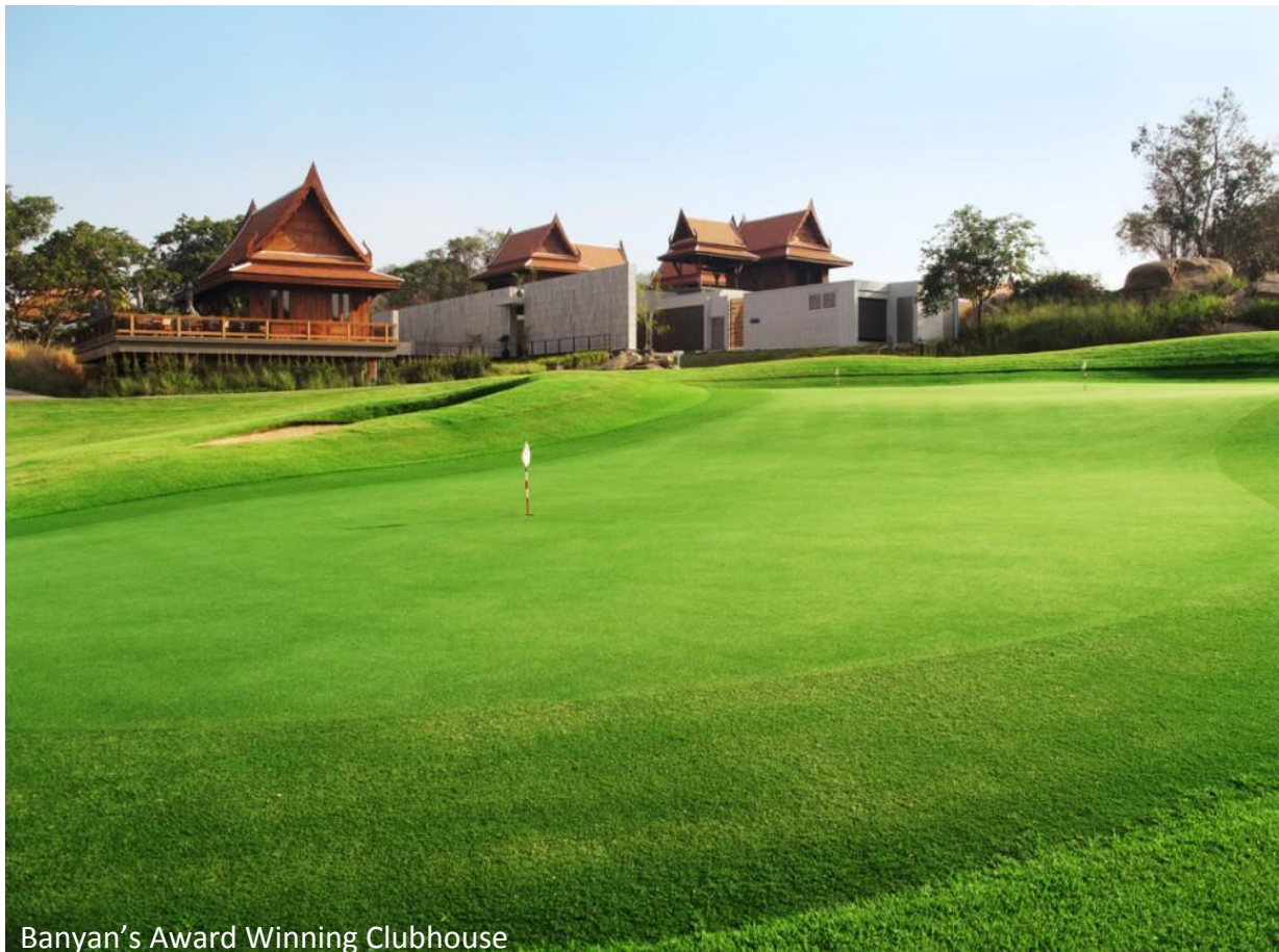
Banyan's Award Winning Clubhouse

This was often talked about inside and outside of the conference. Some clubs in the region are reluctant to change from their traditional ways and are not actively looking for new and innovative ways to bring the excitement back into the club experience. It was generally accepted that there are clear opportunities for transformational leadership, empowerment, and creativity in developing a quality golf experience. As the content of the conference and the awards won at this year's event reconfirms that Banyan Golf Club, Hua Hin position as a market leader in Thailand.